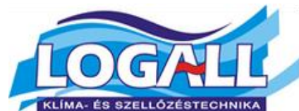
Logall Kft. Kecskemét