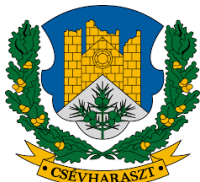
Csévharaszt Községi Önkormányzat